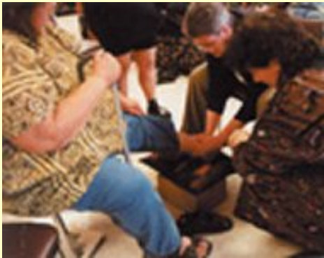
A participant in the diabetes class is evaluated for edema prior to hydrotherapy foot treatment.