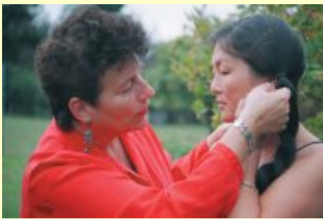
Korn demonstrates self-care massage using auricular points for vitality and relaxation.

healing plants, energy medicine, and other forms of massage and bodywork.