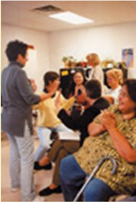
In a natural medicine for diabetes class in the Pacific Northwest, participants practice sensing energy fields prior to implementing the diabetic protocol.